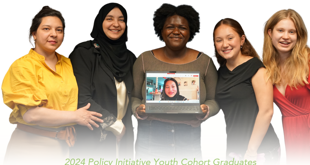
2024 Policy Initiative Youth Cohort Graduates

We continued to explore new and better ways of conducting our youth-focused programing in 2024, steering it toward more hands-on experience in civic engagement and public policy work. We conducted 13 Youth Cohort Meetings and 11 Youth Focused Events, engaging 106 Youth from the community. Programing included education around General Civic Engagement, hands on Public Policy experience, and new Youth Voter Registration law.